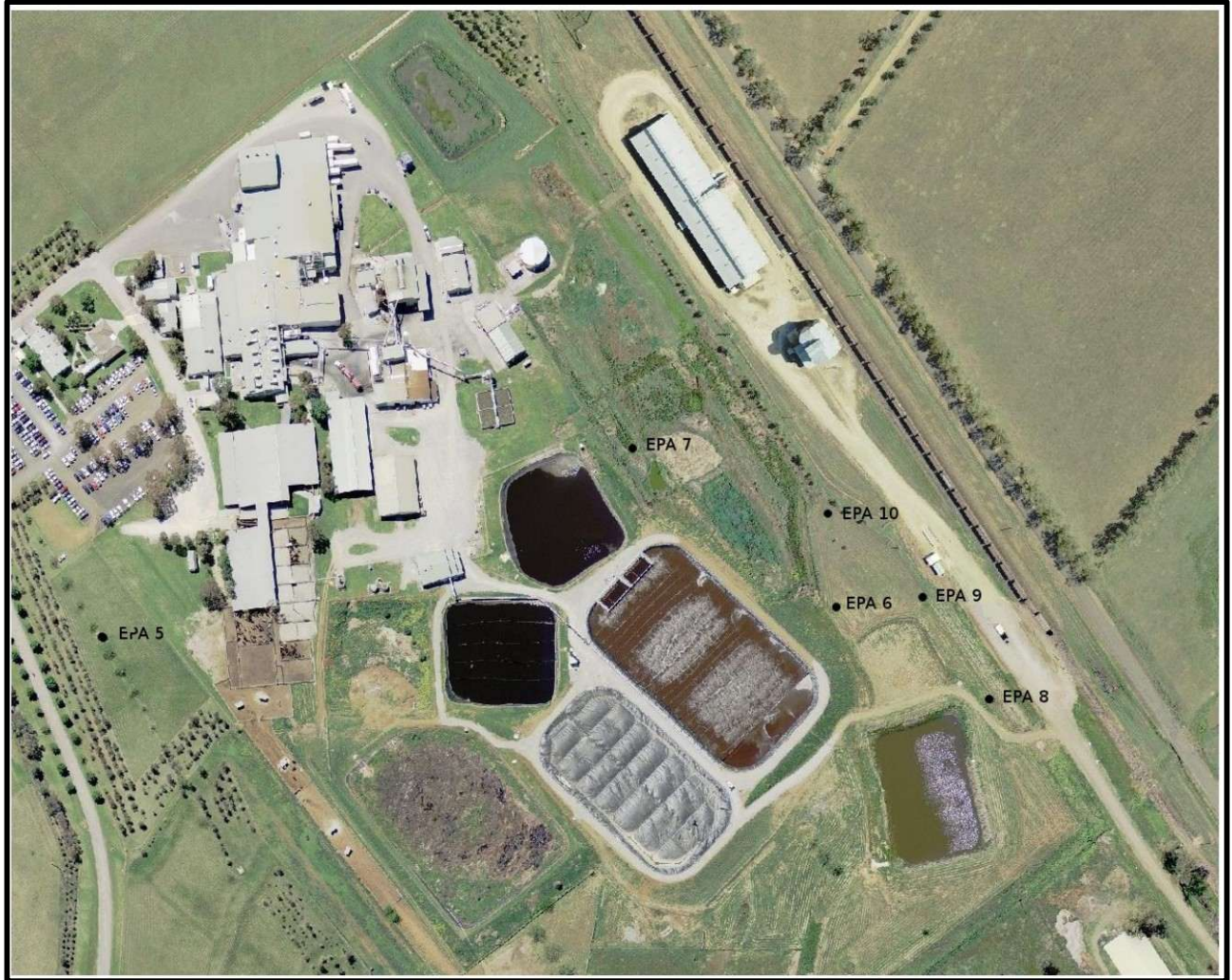
Figure 1: Aerial image of the Teys Tamworth Beef Processing Plant at 32-90 Phoenix Street, Westdale, NSW, 2340. The location and number of the EPA Monitoring Points, corresponding to monitoring point identification in EPL No 1328, are marked on the image.